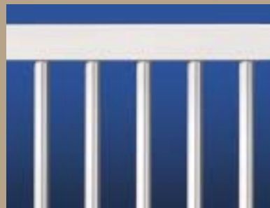
1.5" x 1.5" Fluted Baluster