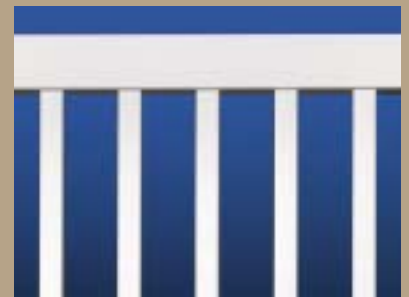
1.5" x 1.5" Square Baluster