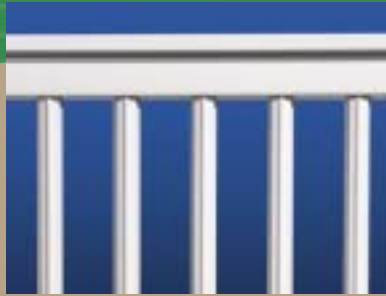
1.5" x 1.5" Fluted Baluster