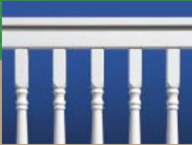
1.5" x 1.5" Colonial Baluster