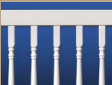
1.5" x 1.5" Colonial Baluster