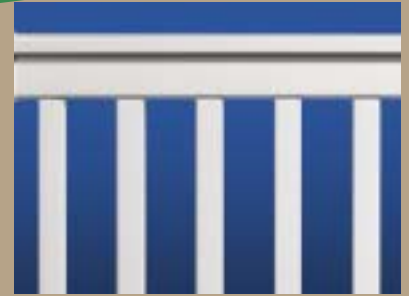
1.5" x 1.5" Square Baluster